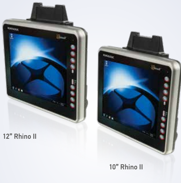
12" Rhino II